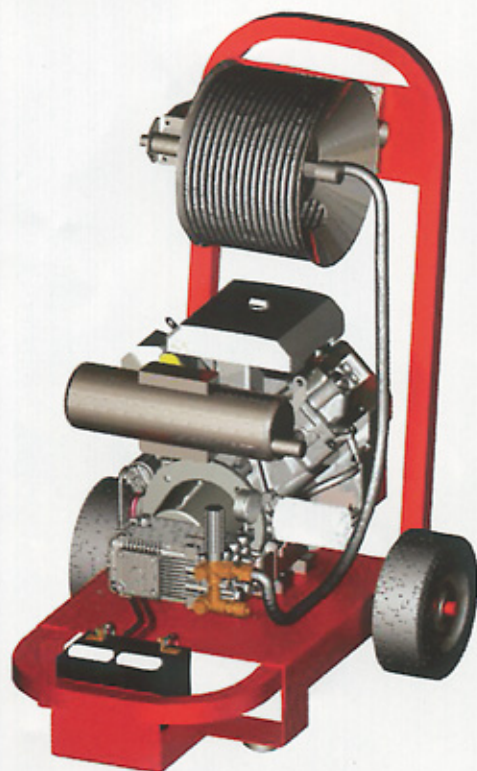
SIoux Model C5G3400 5 GPM @ 3400 PSI Shown with optional hose reel and two-wheel cart

Additional Standard Features: Pressure relief valve and glycerin-filled pressure gauge.